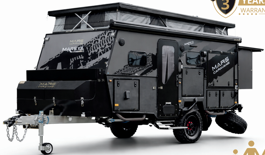
13 FT. OFF ROAD FAMILY POP TOP CARAVAN

Finance options available. Scan for more information.